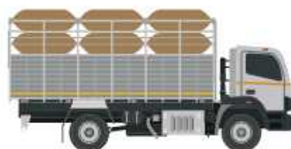
Market Load (perishable)