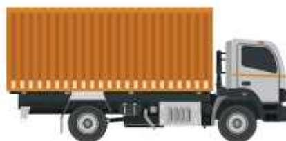
Parcel & Logistics