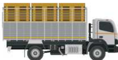
Fruits & Vegetables