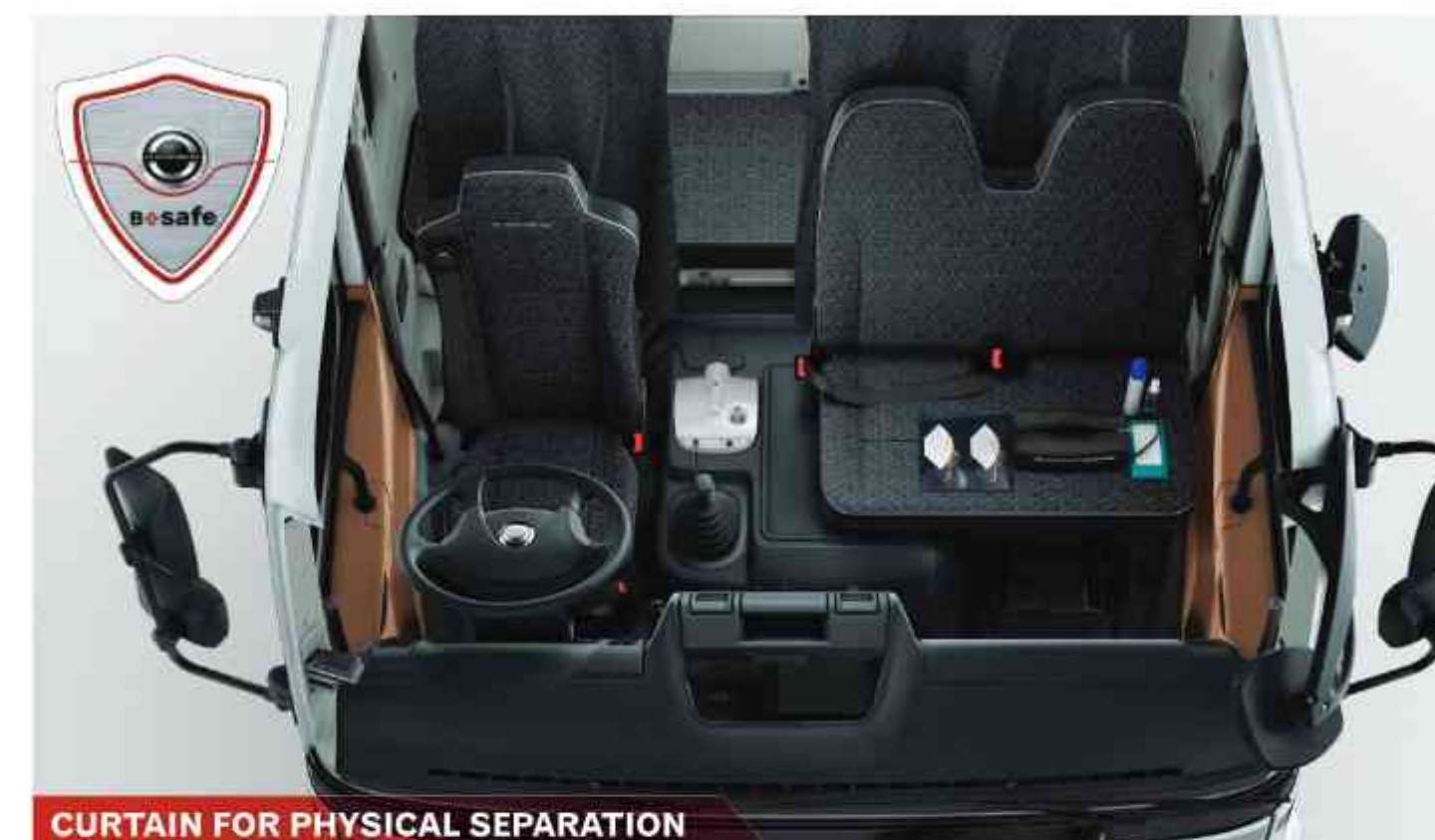
CURTAIN FOR PHYSICAL SEPARATION

As a promise to offer a safe and hygienic cabin on our MDT and HDT trucks, we have introduced 3 safety features as part of the standard offering (Curtains in HDT Sleeper Cabin, Infection Resistant Fabric on Seat and Healthcare Kit for Drivers) and 2 additional features as accessories for sale at the dealer's end (Disinfectant Fogging Machine and UV Sterilizer Box).