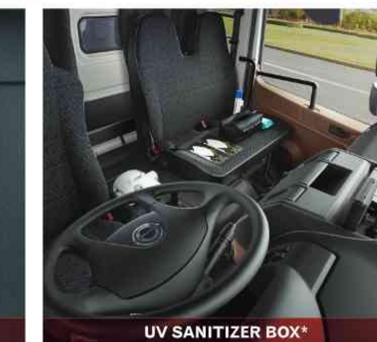
UV SANITIZER BOX*

Note: * Accessories only and not part of Standard fitment.