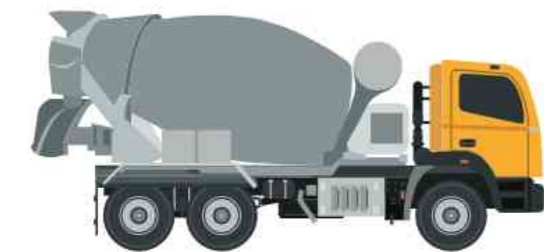
RMC Cabin Chassis