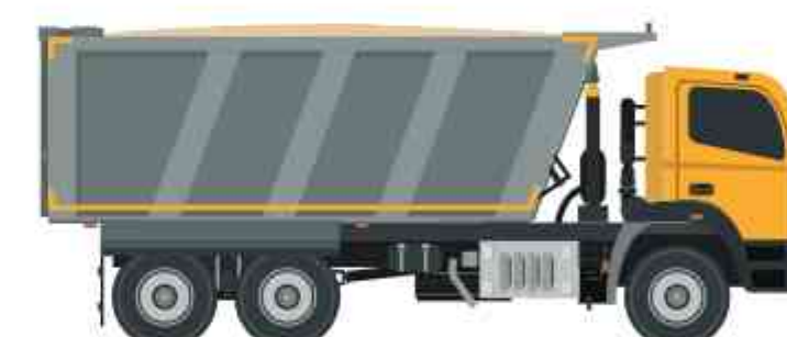
Box Capacity: 16 Cu.m, Wheelbase: 4275mm