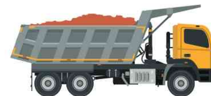
Scoop / Rock Capacity: 14 Cu.m, Wheelbase: 4275mm

The body types available for BharatBenz 2828C include the below mentioned: