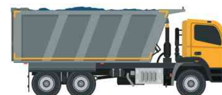
Box Capacity: 22 Cu.m, Wheelbase: 4875mm

Note: All images are for illustrative purpose only.