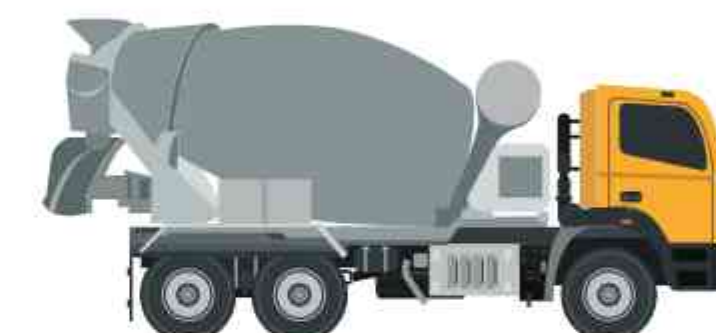
RMC Cabin Chassis Overall length: 7185mm