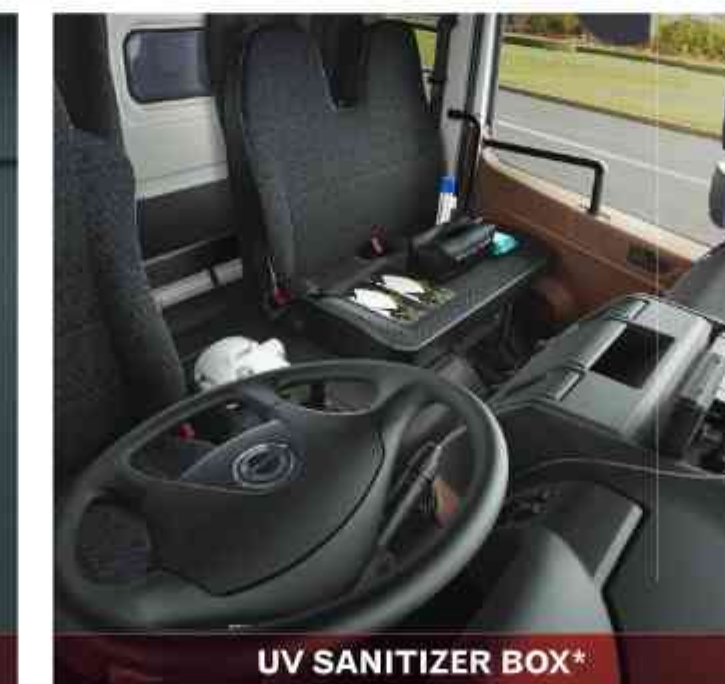
UV SANITIZER BOX*

Note: * Accessories only and not part of Standard fitment.