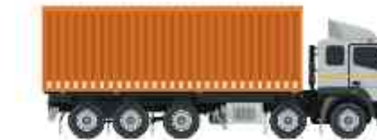
Parcel & Logistics