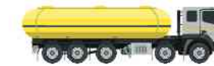
Non - POL Tankers